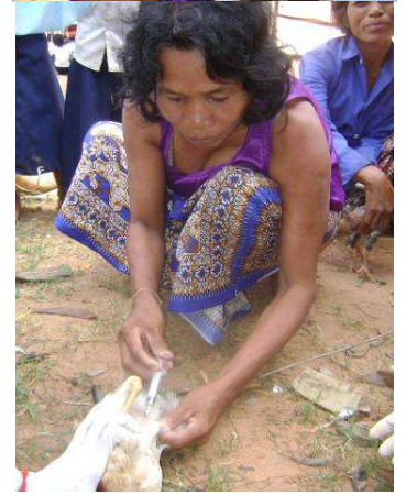
Trainee Practicing Injection