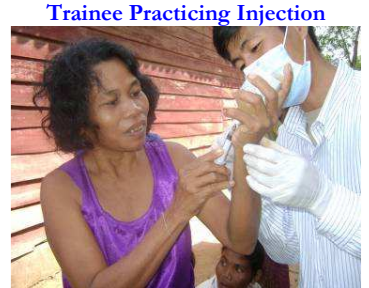
Trainee Practicing Injection