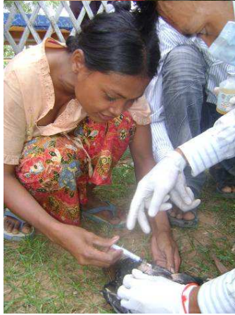
Trainee Practicing Injection