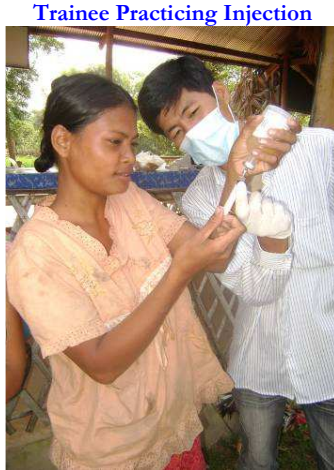
Trainee Practicing Injection