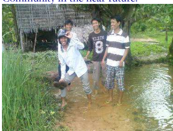
Some Activities in the Action Plan have to be Delayed

- We have invited other four students from Agricultural University to visit the targeted families, community and they quite interested and appreciated to HOC funded which is meeting the people needed and they mentioned that they want to join the young team doing to develop Leang Dai Community in the near future.