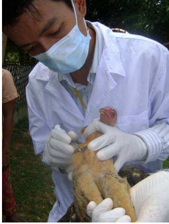
Trainee Practicing Injection